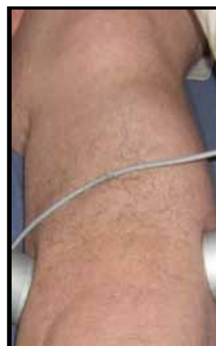
Fig 4. 3 treatments over 5 days