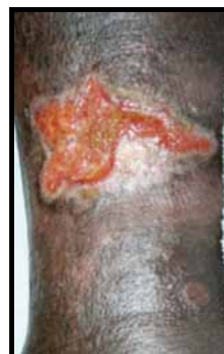
Fig 6. After 10 Treatments, twice weekly (Note the regaining of pigmentation)