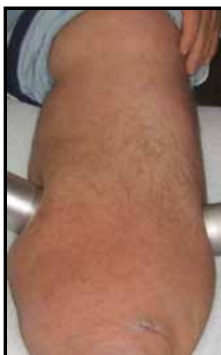
Fig 3. Lymphoedema