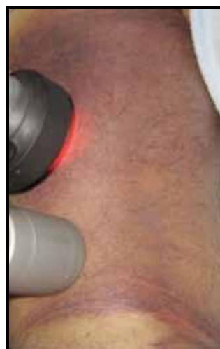
Fig 1. Hamstring injury with hematoma

Light therapy (laser and LED based) stimulates the basic energy processes in