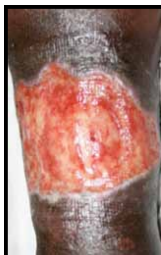
Fig 5. Venous Ulcer (3 years old)