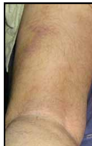
Fig 2. 3 Treatments over 5 Days